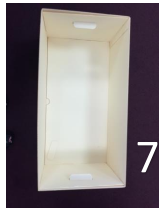
Push handles through to lock into place. See image 7