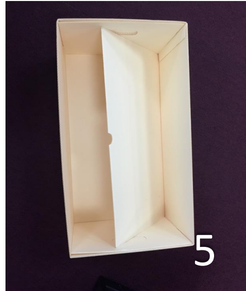
Lift up flaps against side walls and Push down panel with thumb notch to bottom. See image 5/6