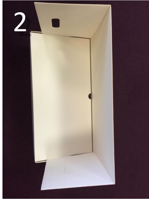
Fold in panel with thumb notch See image 2